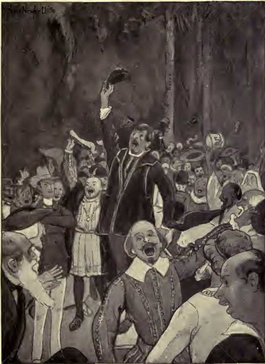
“ THREE ROUSING CHEERS, LED BY HAMLET, WERE GIVEN ”